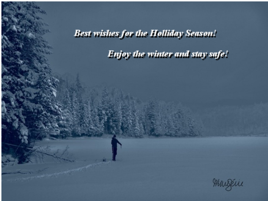
Winter on Blue Sea Lake

To all members of the Association and readers of this bulletin, please enjoy the season and stay safe.