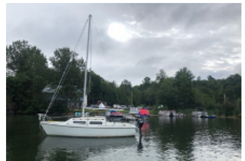
Sail Boat at Rest

Open Discussion: As always, members were given the opportunity to share their concerns and suggestions during the “open discussion” portion of the meeting. Questions were raised about whether more should be done to prevent phosphates and excessive nutrients from entering our lakes and waterways. The importance of the yellow buoy program was reaffirmed, as was the need to continue with the Association’s educational activities and outreach to new cottagers and residents, as well as those renting premises on lakes in the watershed. It was suggested as well that – 10 years later - it might be time for an update to the comprehensive baseline study on the environmental state of the watershed known as the Geiger Report that was produced by the Association in 2010.